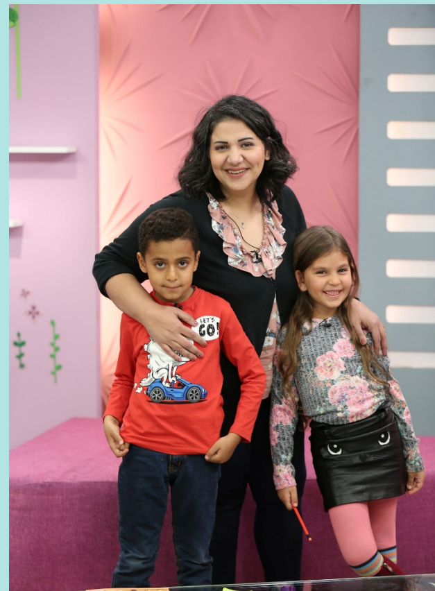
Keys to my Kid